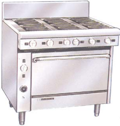
MODEL PE-6R-28 OR MODEL PEC-6R-28