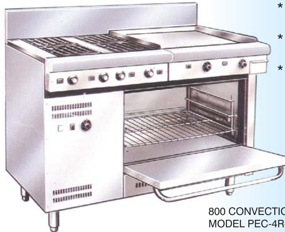
800 CONVECTION OVEN MODEL PEC-4R-24G-28