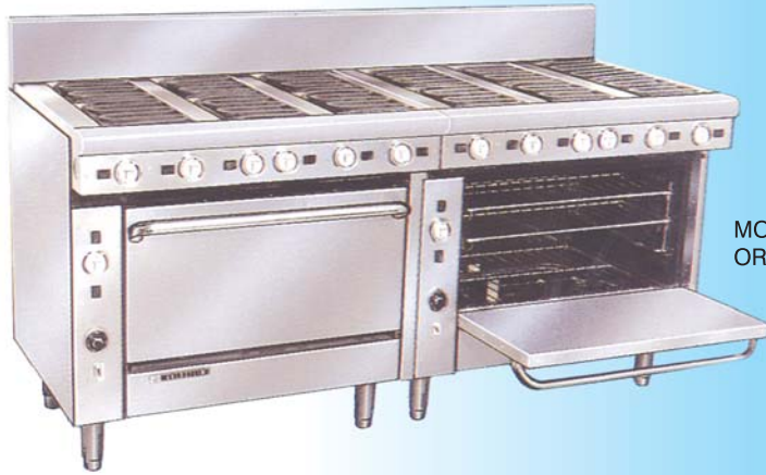
MODEL PE-12R-2-28 OR MODEL PEC-12R-2-28