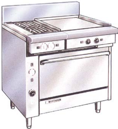
MODEL PE-2R-24G-28 OR MODEL PEC-2R-24G-28